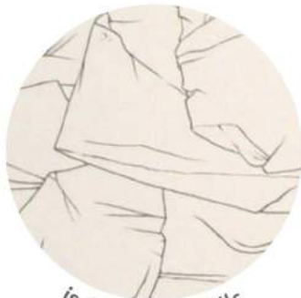
isabel cardiff, mills